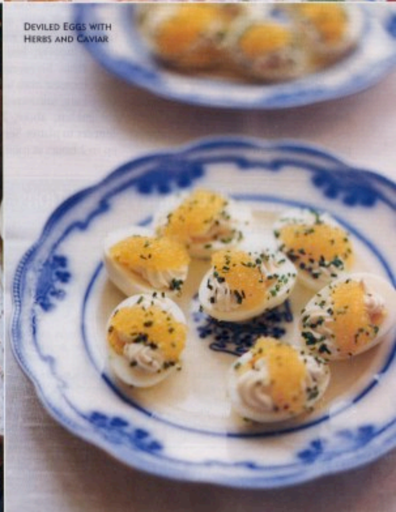
DEVILED EGGS WITH HERBS AND CAVIAR