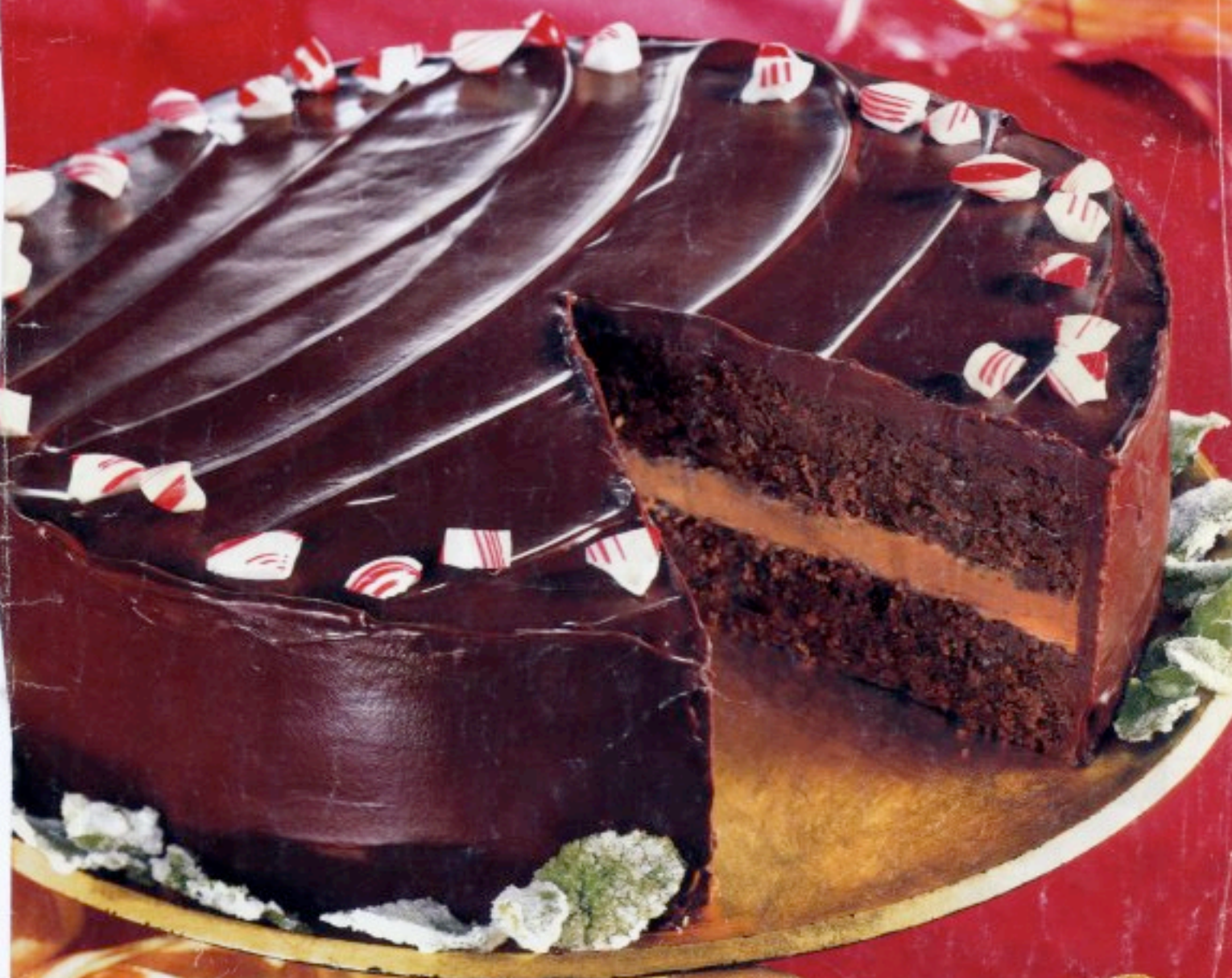
TRIPLE-CHOCOLATE CAKE WITH CHOCOLATE-PEPPERMINT FILLING